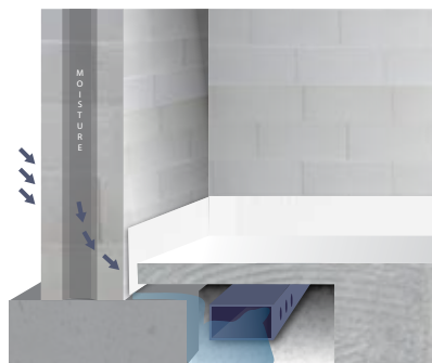
AFTER (OPTION 1) COVER WEEP HOLES ONLY