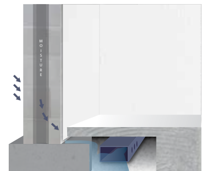
AFTER (OPTION 2) FULL HEIGHT PROTECTION