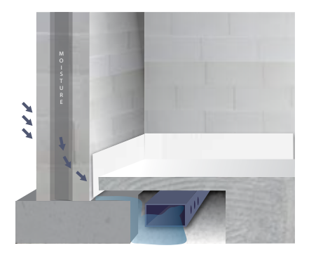
AFTER (OPTION 1) COVER WEEP HOLES ONLY