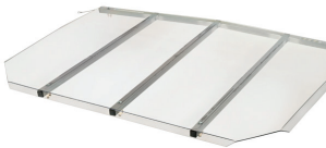
Safe-T-View Covers™ for Casement Style Egress Wells