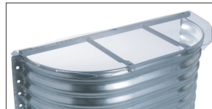
Safe-T-View Covers™ for Straight Wells