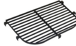
Casement 24" Projection