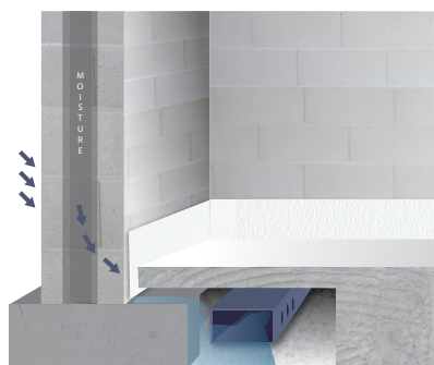
AFTER (OPTION 1) COVER WEEP HOLES ONLY