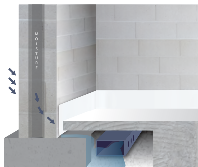
AFTER (OPTION 1) COVER WEEP HOLES ONLY