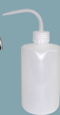
500 mL Bottle